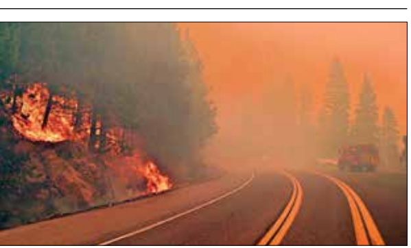
The Caldor Fire burns on both sides of Highway 50 about 10 miles east of Kyburz, California

50 and 89 and burned mountain day night, but he shrugged him cabins as it churned down slopes off, certain that if an evacuation into the Tahoe Basin.